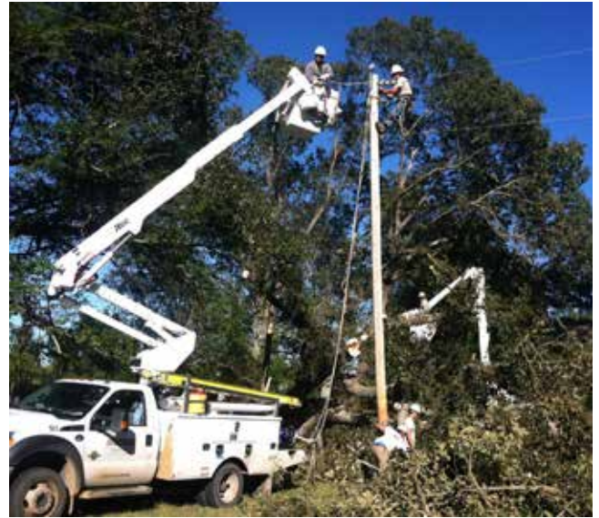
Nolin RECC line techs work to restore power in Aiken, South Carolina, where Hurricane Matthew ripped through the area leaving 9,000 members in the dark.