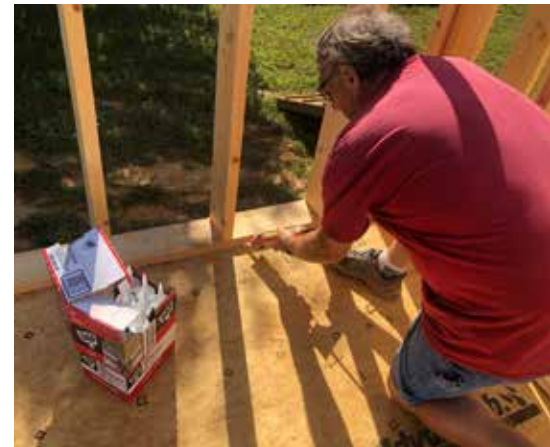
Habitat for Humanity was able to put caulk Nolin donated to good use on local homes.

Even beyond our immediate area, Nolin was given a chance to serve. In September, Nolin sent 10 line technicians and two mechanics to help in recovery work after Hurricane Sally devastated the Gulf Coast of Alabama and parts of Florida. This highlights an important co-op principle—Cooperation Among