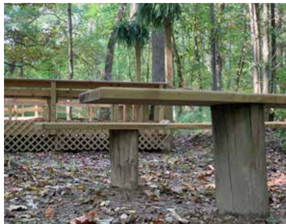
Retired utility poles serve as the foundation for seats in the Emerald Cathedral Amphitheater near Freeman Lake in Elizabethtown.