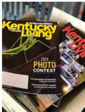
Nolin delivered extra copies of Kentucky Living magazine to Sunrise Manor in Hodgenville in September for residents to enjoy.