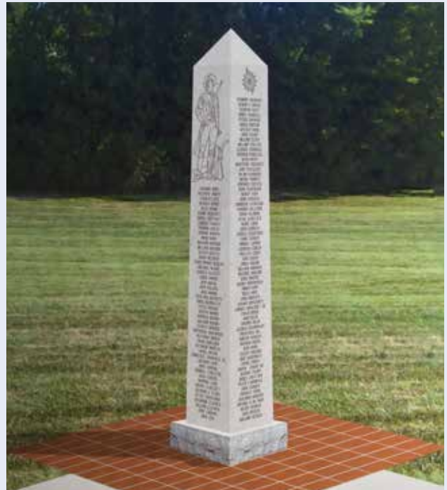
A rendering of the American Revolution Patriots Memorial to be placed in Freeman Lake Park, Elizabethtown.

The obelisk has been ordered and the estimated completion date is September 2021.