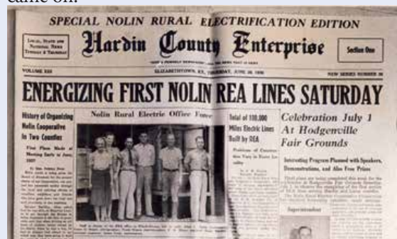
The front page of the Hardin County Enterprise announces the first lines energized in Nolin RECC service area in 1939.

Energizing the first lines in the Nolin RECC service area (formerly “Nolin REA”) was front page news in 1939. Rightfully so! Rural communities in the area were finally receiving electricity to their farms, homes and businesses—years after many of their urban neighbors. The groundwork had been laid during the previous year by local residents who joined together to form our cooperative—and by July 1, 1939, the lights came on.