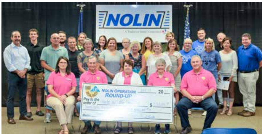
Operation Round-Up board members and grant recipients at the presentation ceremony in June in Nolin's Cooperative Meeting Center.