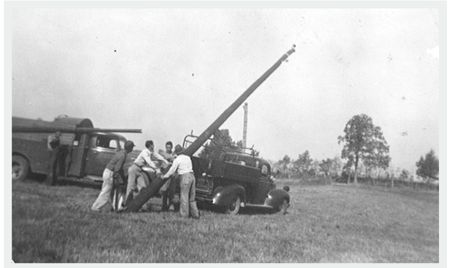
The first poles and lines in Nolin service territory were set by hand. Crews dug post holes, took down (and replaced) fences for access and spools of wire were often transported by wagon.

nergizing the first lines in the Nolin RECC (formerly "Nolin REA") service area was a true community effort. Rural residents in the area worked together to bring electricity to their farms, homes and businesses. Our cooperative was formed in 1938 and by July 1, 1939, the lights came on.