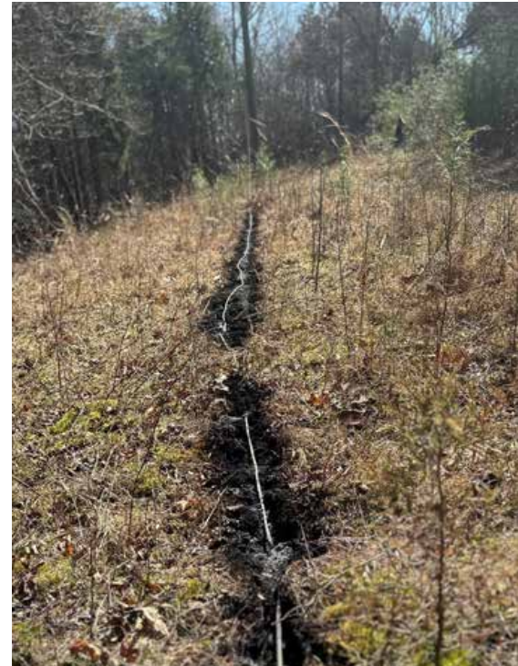
This power line was found on the ground in the Nolin service territory following the windstorm that caused significant damage across Kentucky in March. After verifying that the line was deenergized, Nolin RECC Senior Service Technician Jamie Price took this photo to show how it burned the ground around it while it was still energized. This photo shows the importance of assuming all power lines are energized.

In addition to safety around downed power lines, it is essential to keep items such as ladders, kites, drones and farm equipment away from power lines. Observe your surroundings before using and work at a safe distance. Always call 8-1-1 at least two to three days before you dig to avoid striking a line with a shovel or other equipment. Also, if you see that a tree branch is touching a line, report it to us so that we can have our trained professionals remove it.