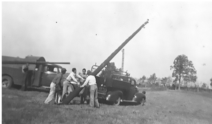
The first poles and lines in Nolin service territory were set by hand. Crews dug post holes, took down (and replaced) fences for access and spools of wire were often transported by wagon.

nergizing the first lines in the Nolin RECC (formerly "Nolin REA") service area was a true community effort. Rural residents in the area worked together to bring electricity to their farms, homes and businesses. Our cooperative was formed in 1938 and by July 1, 1939, the lights came on.