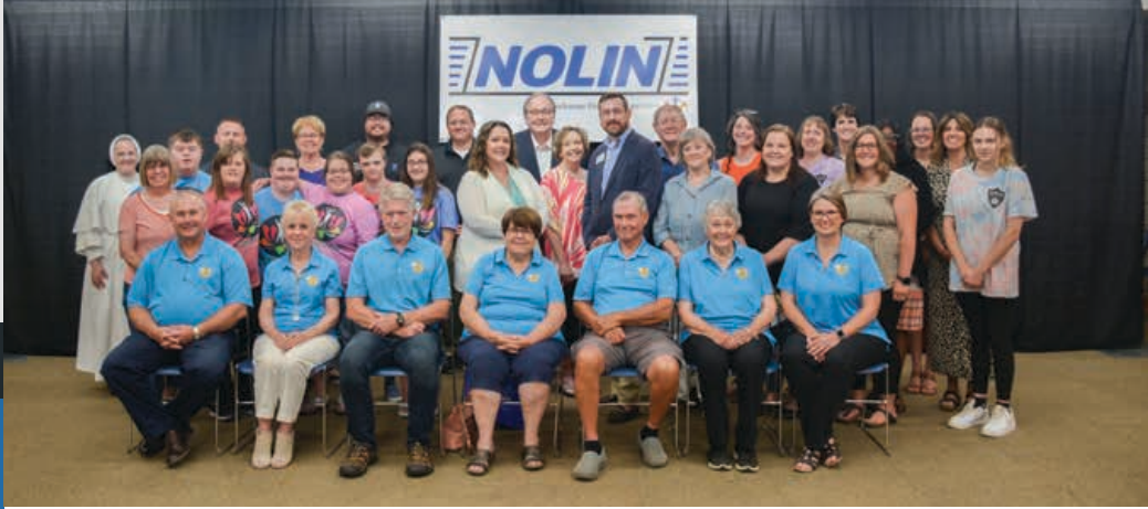
Members of the Operation Round-Up board of directors and local grant recipients at the annual meeting business session in June in Nolin's Cooperative Meeting Center.