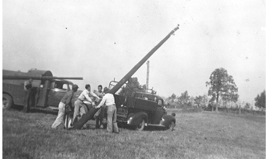
The first poles and lines in Nolin service territory were set by hand. Crews dug post holes, took down (and replaced) fences for access and spools of wire were often transported by wagon.

Energizing the first lines in the Nolin RECC (formerly Nolin REA) service area was a true community effort. Rural residents in the area worked together to bring electricity to their farms, homes and businesses. Our cooperative was formed in 1938, and by July 1, 1939, the lights came on.